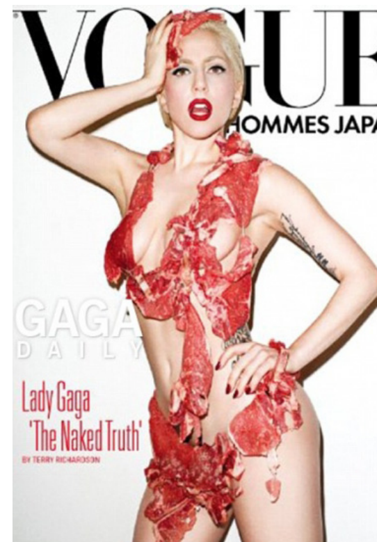
Bacon clothing? Whats next, beef curtains? *tomatoed*

I'd rip a big hole in them. Karma is attire. How about... meat! not kind to expensive things, lemme tell ya.